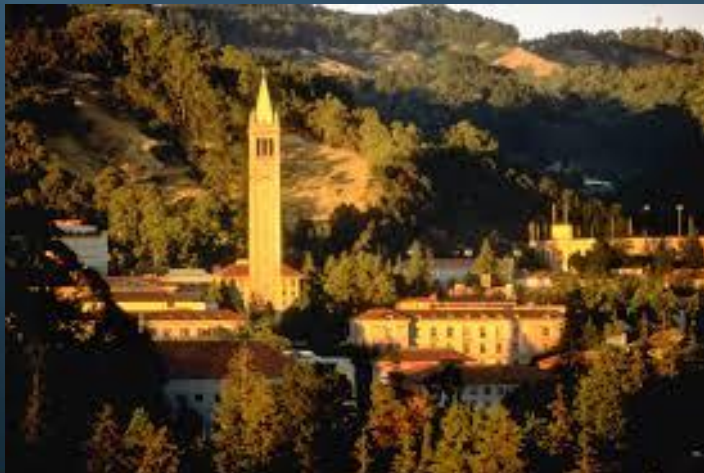
UC Berkeley Campus