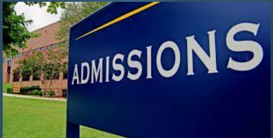
Berkeley Admissions Office

III. Scholarship Requirement: A minimum 3.0 GPA is required and all classes used to meet entrance requirements must be completed with a “C” or higher.