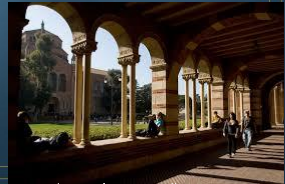
Outside UCLA's Royce Hall